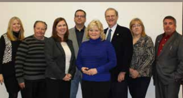
Noise monitor expert attended Technical Committee meeting.