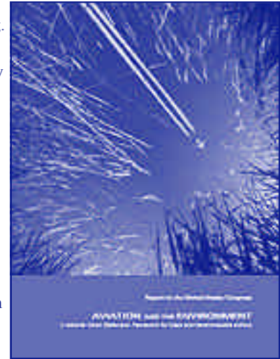
Aviation and the Environment Report

The full report can be downloaded from the ONCC Web site at www.oharenoise.org .